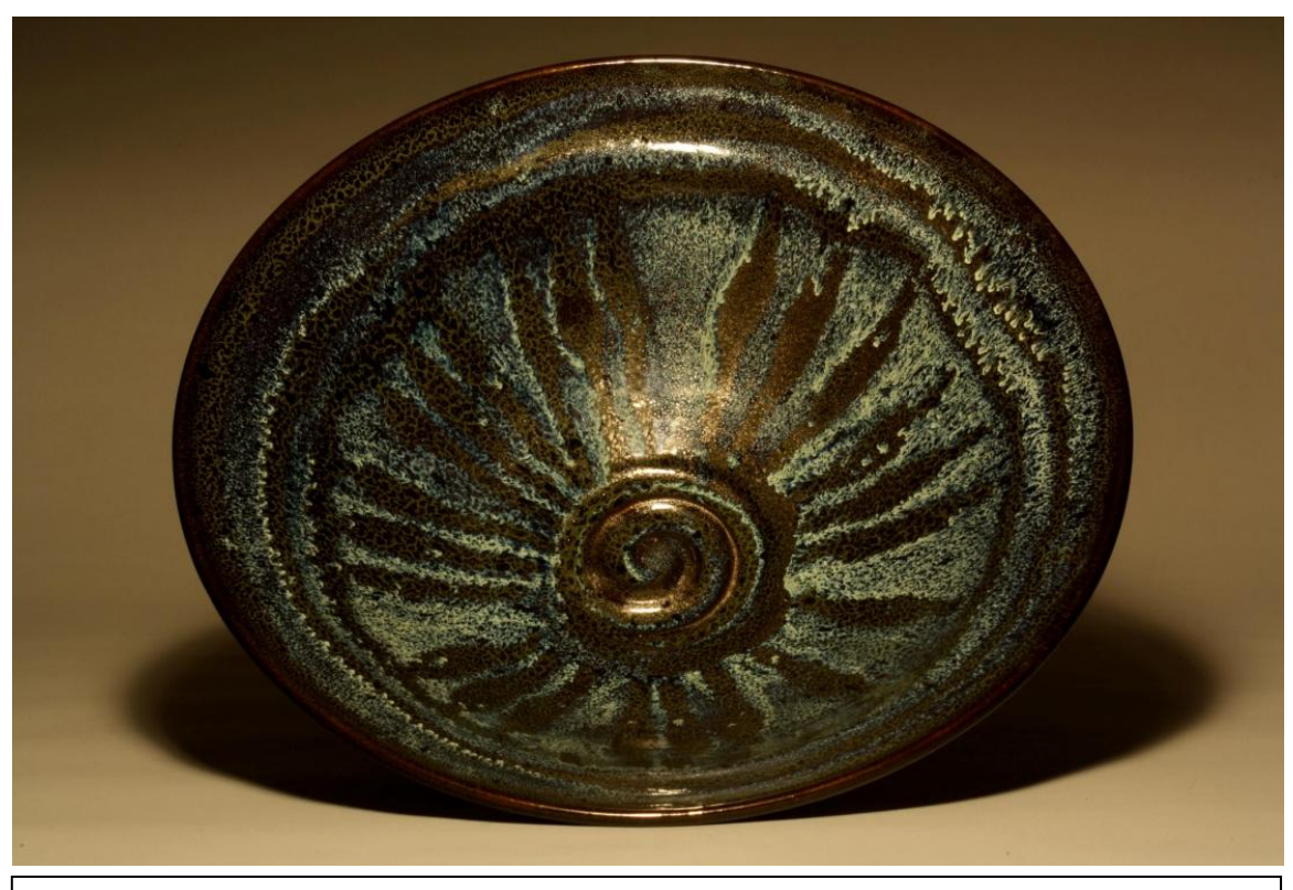
Figure 20 - Full view of Figure 19.