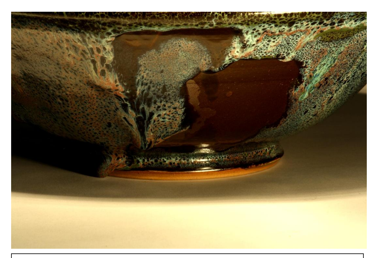
Figure 12- This is an example of crawling. Notice the hanging glaze next to the brown area. The glaze has crawled from the point of contact and collected to form a hanging drip.

Crawling occurs when glaze is applied to the surface of a pot and water