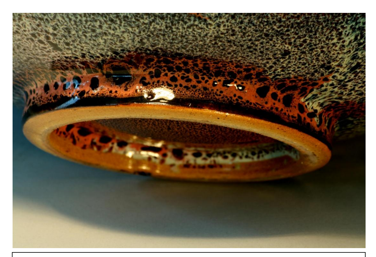
Figure 3- The sodium halo can be seen on the foot ring of this bowl. This is the foot for Figure 9. Notice the large spots around the foot and even underneath the bowl.

components. Frit 3134 is used for fluxing. Edgar plastic kaolin is the refractory. A small amount of nepheline syenite introduces sodium along with the gerstley borate from cover glaze one. The sodium component from cover glaze one and cover glaze two becomes evident in the discoloration of the foot. This is commonly called a sodium halo (Figure 3).