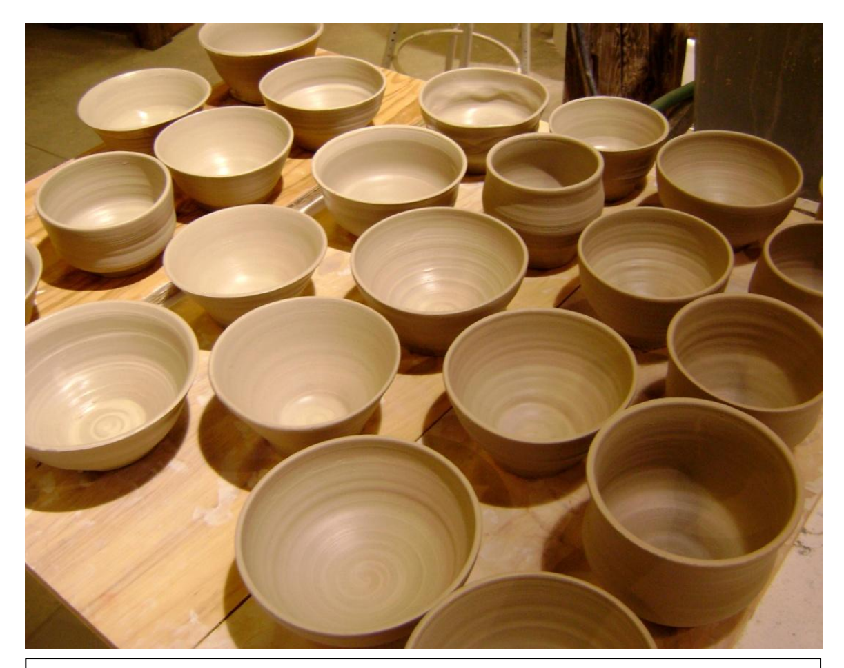
Figure 2- These bowls have been thrown for the Empty Bowl Project. The bowls are drying so they can be trimmed and fired.

The bowl is more than just a pleasing shape to make on the potter's wheel. It is a symbol of where we have come from as a society and how we interact and take care of one another today. For these reasons and others to be discussed in later chapters, the bowl is an important and special functional object. That is why I have chosen it as the vehicle for exploring beautiful form and oil-spot glazing.