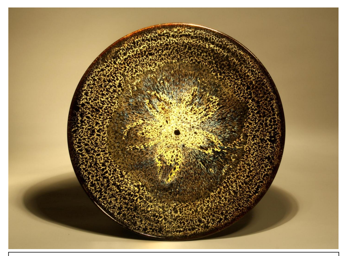
Figure 10- The interior space provides a large area to apply glaze. This is cover glaze one with yellow stain at 10%.

apply layers of glaze. This bowl has been re-fired so the spots elongate and move toward the center. The blue highlights also became more apparent after the second firing.