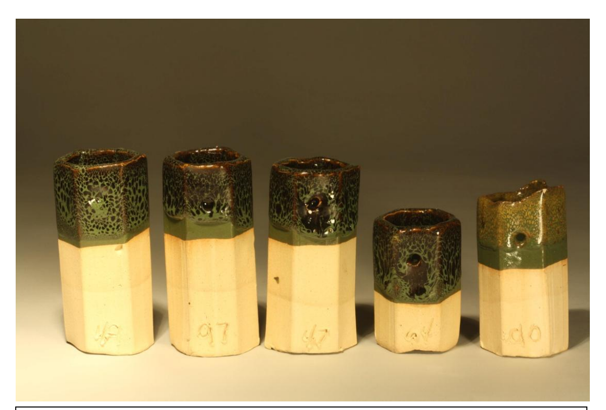
Figure 8- From left to right, one percent magnesium carbonate was added. Notice the yellow color of the far right tile. Five percent magnesium carbonate changes the color of the spot. The hanging glaze is not as noticeable.

Because dolomite was added to the recipe and the ingredients now totaled over 100-grams, the recipe needed to be re-totaled. For example, I added 3-grams of dolomite to the base recipe so the new total is 103-grams. Divide 3-grams of dolomite by the new total of 103-grams and the result is .029. Multiply that number by 100 and the new total of dolomite in a 100-gram batch is 2.9 grams. I rounded up and made it even at 3-grams.