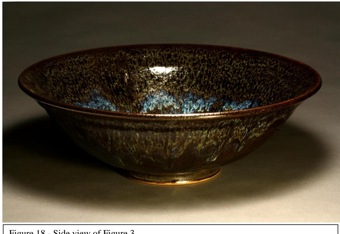
Figure 18 - Side view of Figure 3