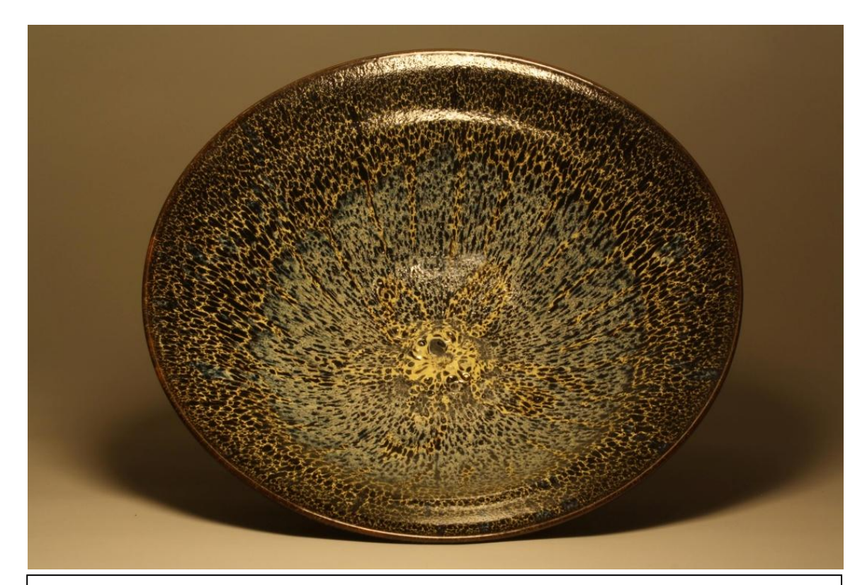
Figure 17- This bowl has been fired twice and shows the dragging of the iron spotting towards the center of the bowl.

Re-firing in oxidation permits the glaze to move, elongate, and stretch the iron spot and waxed iron spot design. The base glaze used for this research provides a black spot on the first firing. There was no need to re-fire in reduction because re-firing was only used to smooth over the surface. Most of the finished bowls completed for this project were multi-fired. When the waxed designs and colors were ideal for exhibiting the full range of the oil spot possibilities, I did not re-fire.