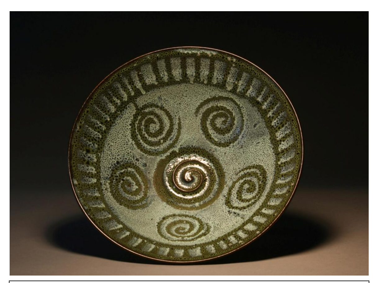
Figure 13- The spiral design is a product of the wheel and carried over when decorated on the banding wheel.