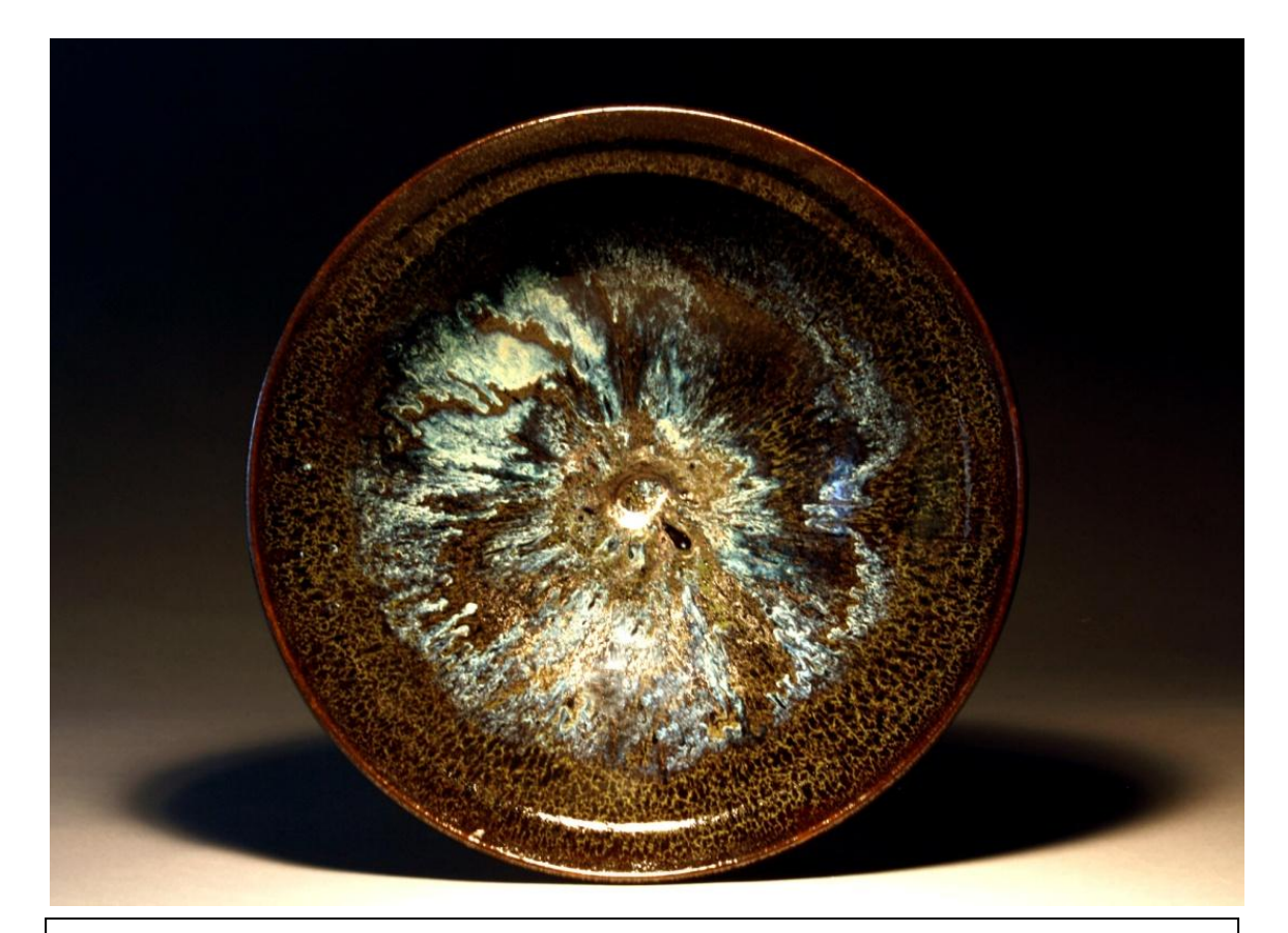
Figure 4- The combination of all three glazes with wax designs. The waxed designs move toward the center of the bowl when fired twice.

The colorants in cover glaze two are rutile and copper carbonate. Rutile is natural titanium oxide and iron oxide. When combined with copper oxide, it produces yellow-greens. When cover glaze two is added, the result of the combination of all three glazes is a range of blues and greens (Figures 4 and 5). I use stains such as blue, red, green, and yellow in the amount of 10% in addition to the 100-grams of base in cover glaze one. I did not change cover glaze two. Figure 5 is an example of the red stain used in cover glaze one.