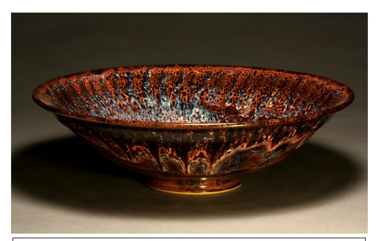
Figure 21 - Side view of Figure 22.