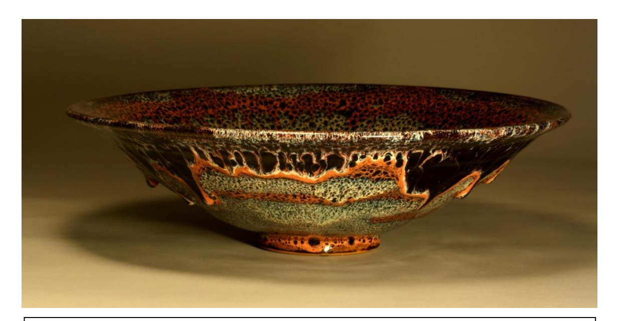
Figure 9- The hanging glaze is a characteristic of the oil-spot. Notice the large spots on the exterior of the rim.

flow of the glaze when it melts, but is also slows the viscosity when it reaches the belly of the bowl. Sometimes the glaze melts and runs down into a nipple shape hanging off the belly of the exterior surface of the bowl. As you can see in Figure 9, the glaze runs down the belly of the bowl and exhibits the characteristic oil-spot hanging glaze.