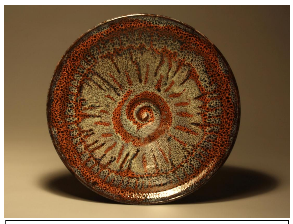
Figure 25- Full view of Figure 9.