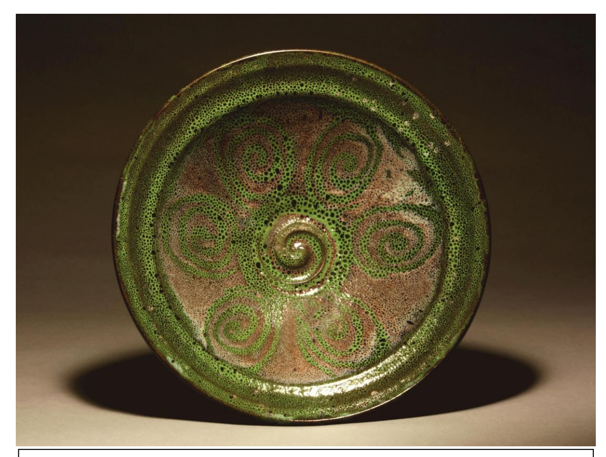
Figure 14- The spiral design applied with wax over cover glaze one and allowed to dry. Cover glaze two is then applied.

Once the wax has been applied and left to dry for about ten minutes, cover glaze two is applied using the same pouring method. Cover glaze two is mixed into 2,000gram batches as well and has the consistency of skim milk to achieve blues, and whole milk to achieve purples. A thick coat of cover glaze two will result in a runny mess. Cover glaze two is poured over the entire interior and exterior surface using the same