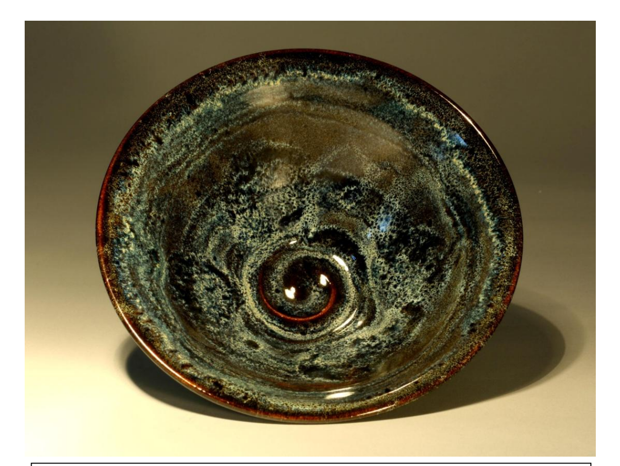
Figure 15- This bowl has been fired twice. After the first firing, the bowl was removed from the kiln at 300^{\circ} (F) and re-glazed using cover glaze two, and then refired. Notice the iron spotting is not as pronounced.

abstractly, and provided a glossy finish (Figure 15). The spots seem to fade away and are not as noticeable. Re-glazing after firing once was not the best option.