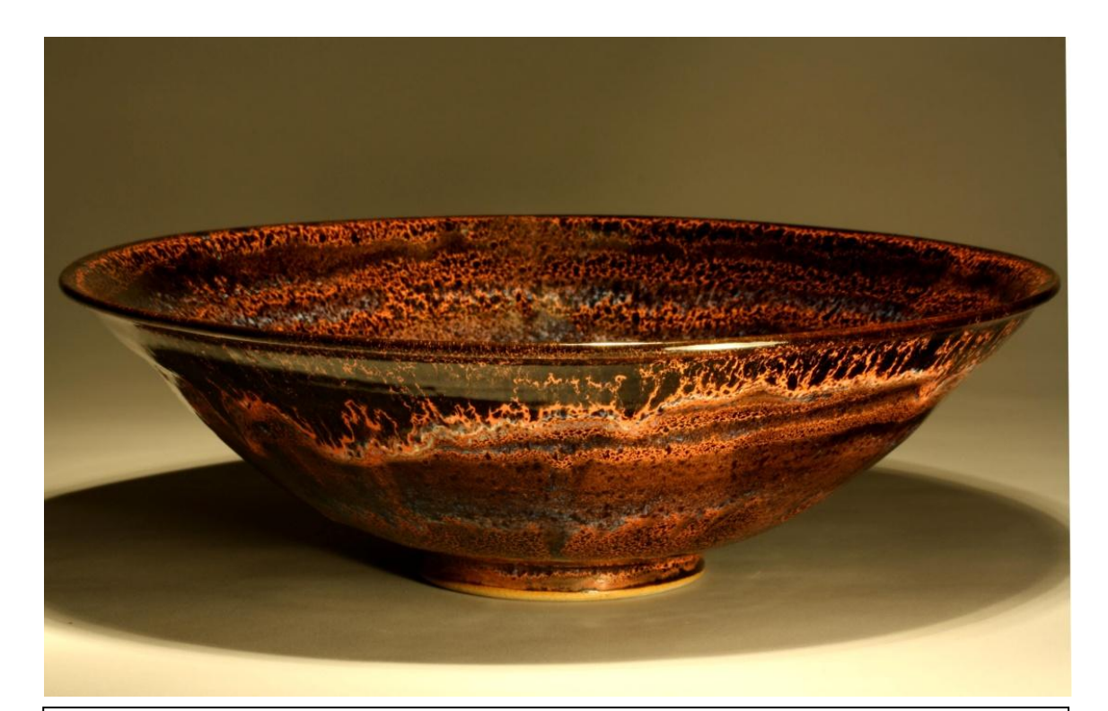
Figure 26- Side view of Figure 5.