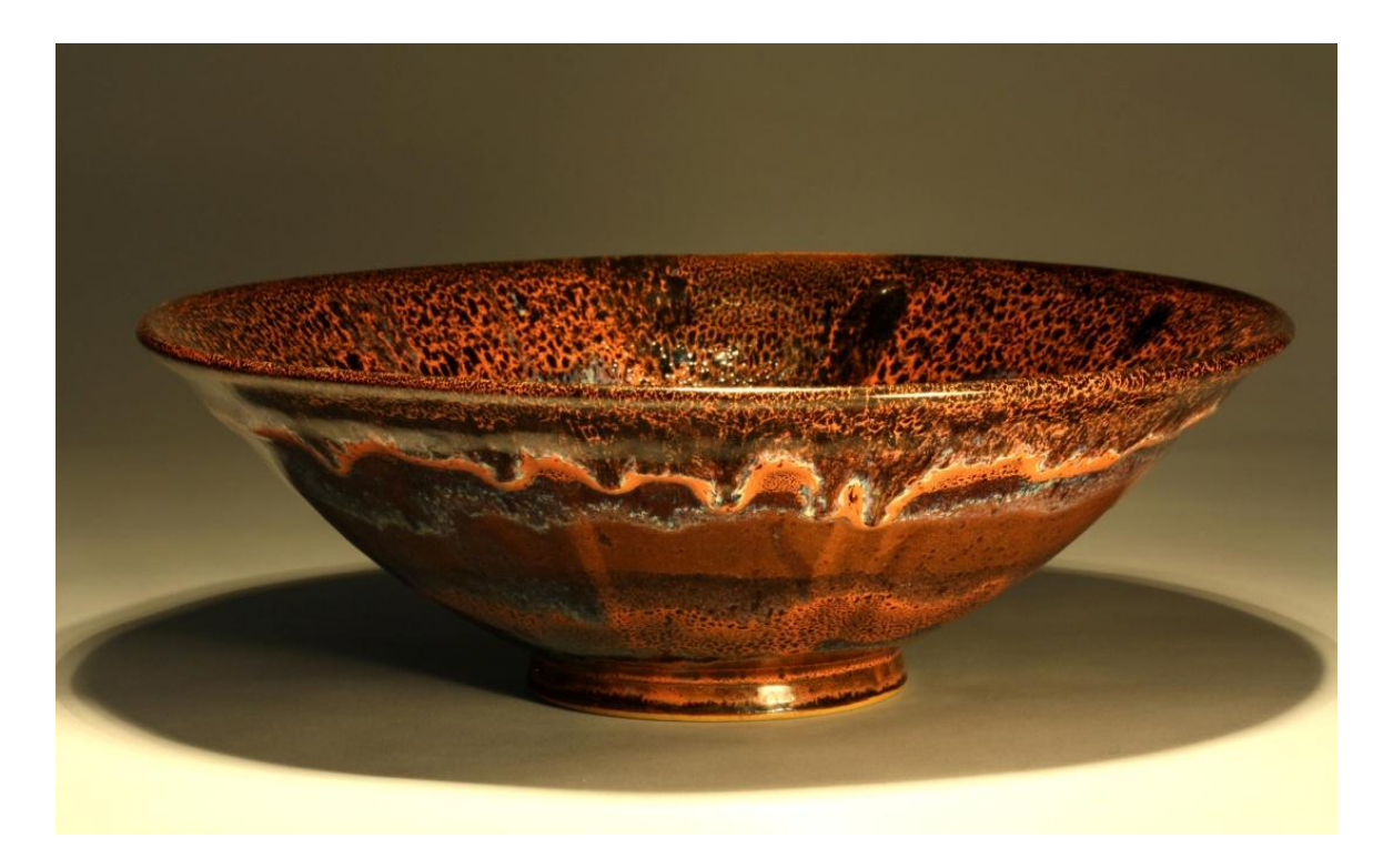
Figure 23 - Side view of Figure 24.