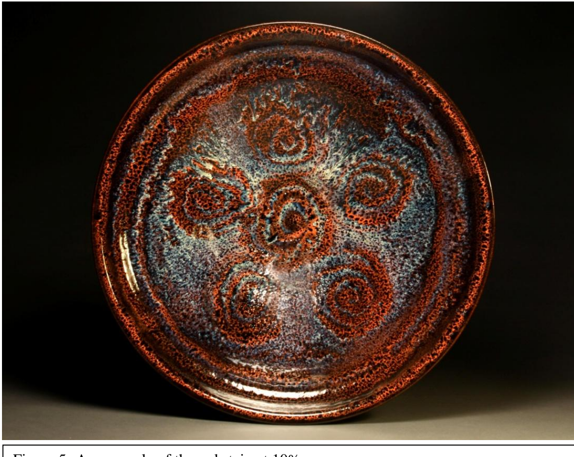
Figure 5- An example of the red stain at 10%.

My oil-spot recipe for the base, cover glaze one, and cover glaze two are below. However, there are endless recipe options for cone 6 oil-spot bases and cover glazes that can be applied using a balance of the oxides described. Obtaining the correct ingredients and proportions involves knowing the properties of the elements and how they react with each other under heat. Testing the ingredients using a tri-axial line blend, regular line blend, and/or a progression blend are three ways to understand the ingredients and their