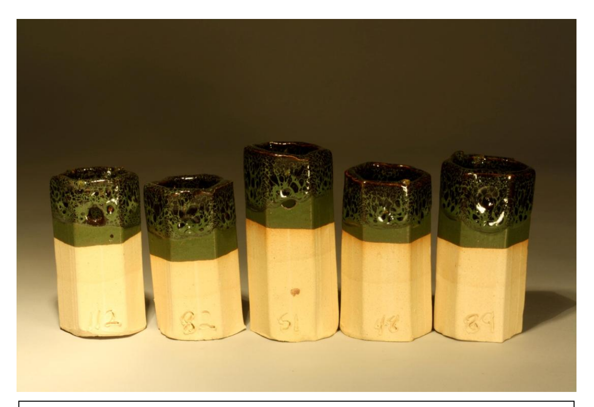
Figure 7- Five percent whiting was removed from the base. From left to right, one percent dolomite was added. Notice the pits and craters in the glaze. The hanging glaze is not even and not smooth.

noticeable. This test indicates that whiting is essential to the recipe and removing it inhibits the iron spotting and healing of the glaze. In Figure 7, all of the tiles have craters and the glaze is not mature.