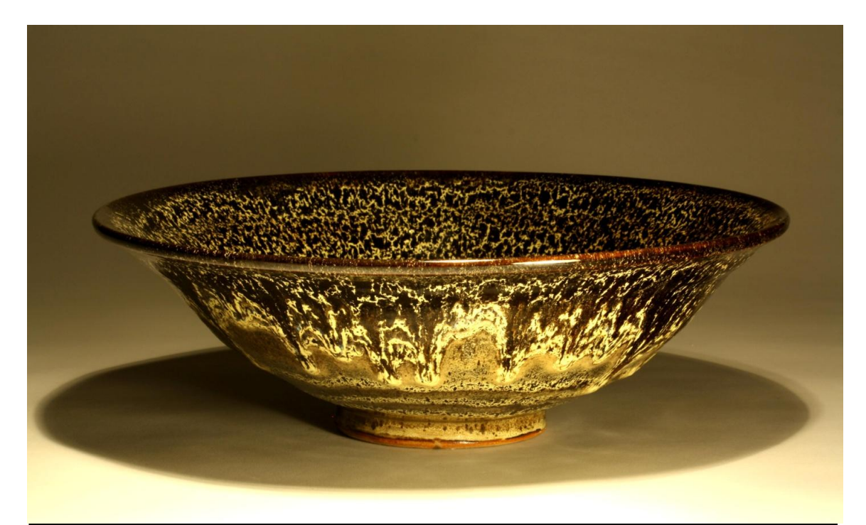
Figure 11- The foot of the bowl provides support and acts like a pedestal. Side view of Figure 10.