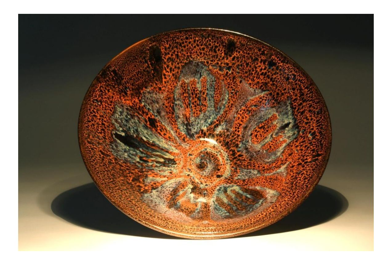
Figure 24- Full view of Figure 23.