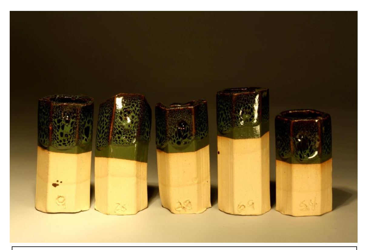
Figure 6- From left to right, one percent of dolomite was added. Notice the hanging glaze on the middle tile. The glaze is also smooth after one firing. The breaking of the glaze on the corners is very nice.

The second test, Figure 7, consisted of removing 5% whiting and adding dolomite up to 5% to the base recipe. The glaze was cratered on the test tile with only 1% dolomite and 13% whiting. There was no visible hanging glaze and the spots were not completely formed. With 5% dolomite and 13% whiting, the glaze is getting close to mature spots, but the yellow halo on the breaks of the test tile and the rim were not