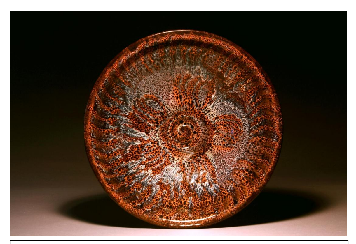
Figure 22 - Full view of Figure 21.